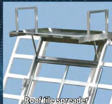
Roof tile spreader for crane operation