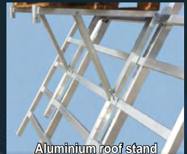
Aluminium roof stand