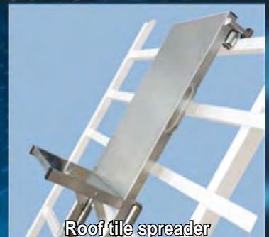
Roof tile spreader for elevator operation