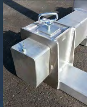
Adjustable forks, specially welded profiles for high load capacity