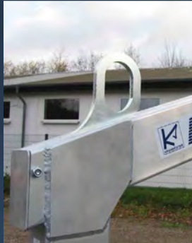
Easy hooking of the crane hook