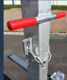
Practical - good functionality and handling