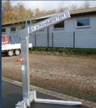
Automatic weight compensation and maintenance-free compression spring system